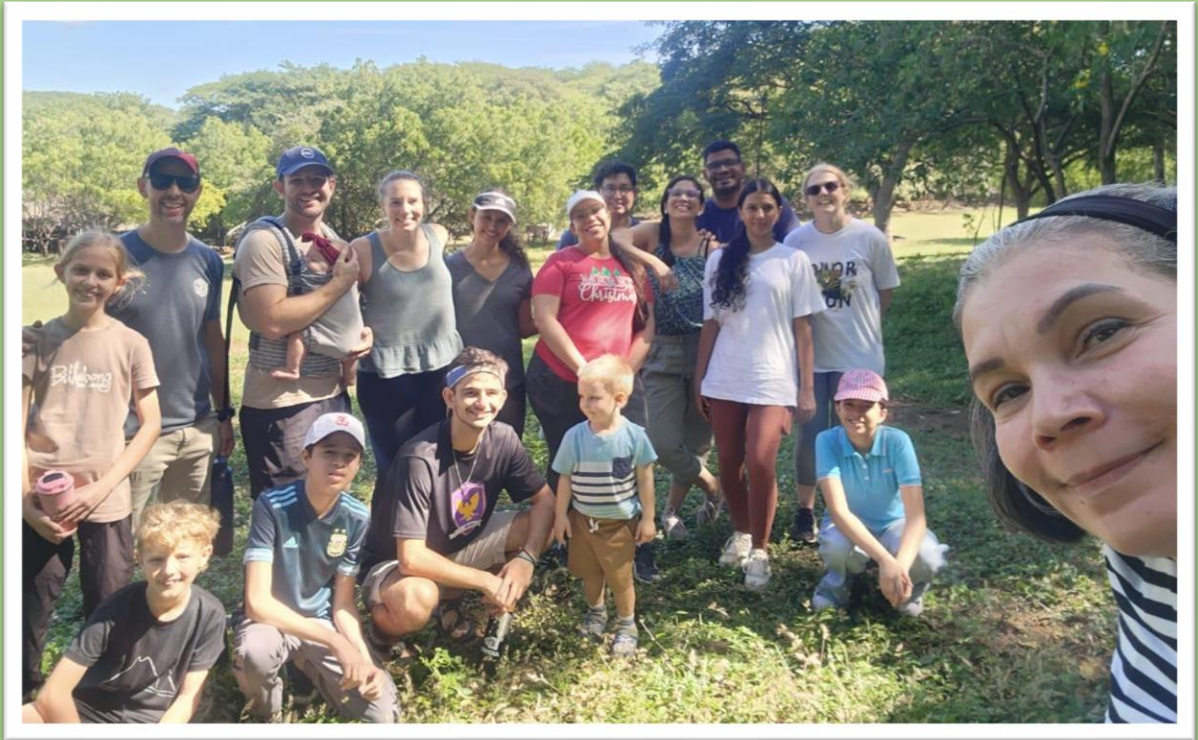
Above The EMI Nicaragua team retreat in December Below Independence Day Celebrations in September

If you would like to know more about our ministry you can check out our website www.emi-quails.com or write to us at quails.emi@gmail.com